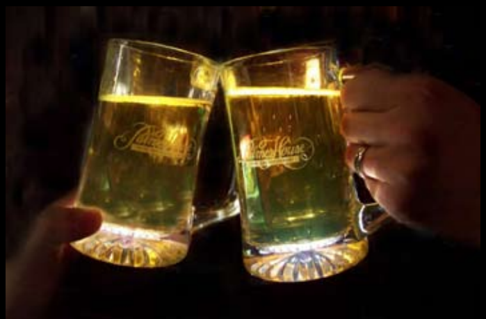
In the Pub; drafts in hand.