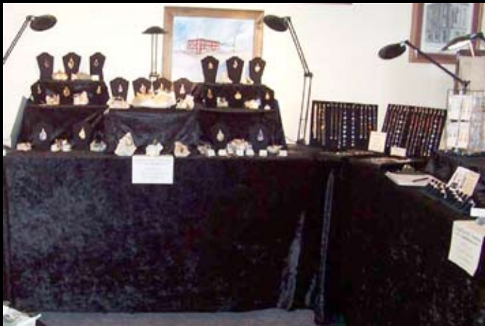
Jewelry on display and for sale during the social hour on Friday night.