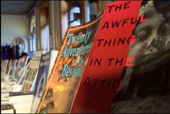
One of the many books that were on display and for sale during the social hour Friday night.

Remember that during the investigations on each floor, it was very dark. All the lights were turned off. The only glimpse of light we'd get was from our flashlights or the flash from digital cameras.