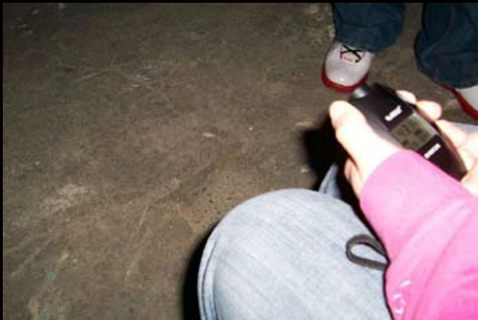
In the basement, using a digital thermometer, the temperature started at 77 degrees and dropped to 39 degrees within minutes.