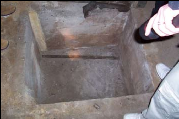
Where the flashlight is beaming in the square cemented hold in the basement, is where the seam is that an inch of plastic or so is peaking out. The hole has a hollow sound when pounded on.