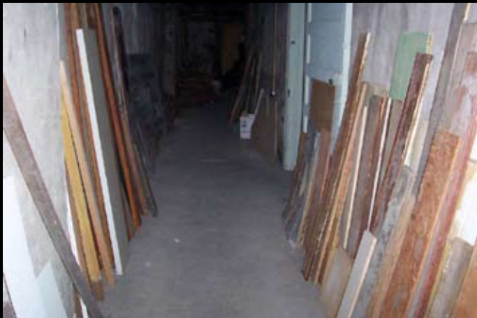
A long dark hallway in the basement.

Remember that during the investigations on each floor, it was very dark. All the lights were turned off. The only glimpse of light we'd get was from our flashlights or the flash from digital cameras.