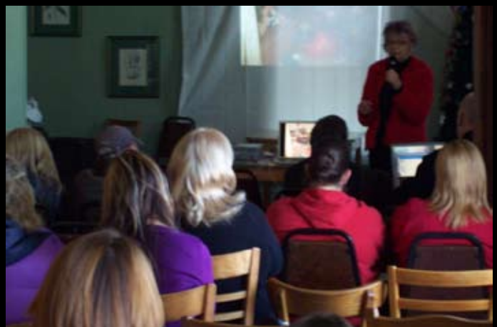
Investigators tune in during one of Saturday's seminars.