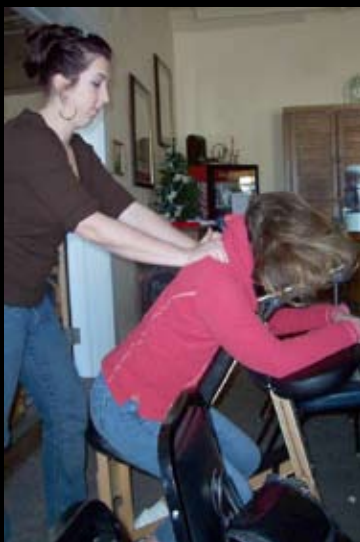
Relaxing massages given during the social hour Friday night.