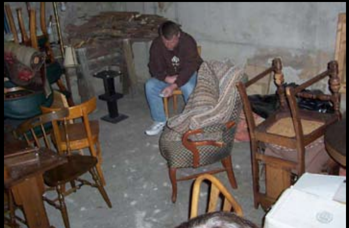
One investigator silently sitting by himself using a KII meter.